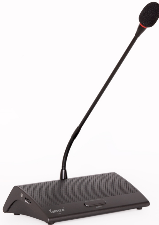
YC838D Delegate unit