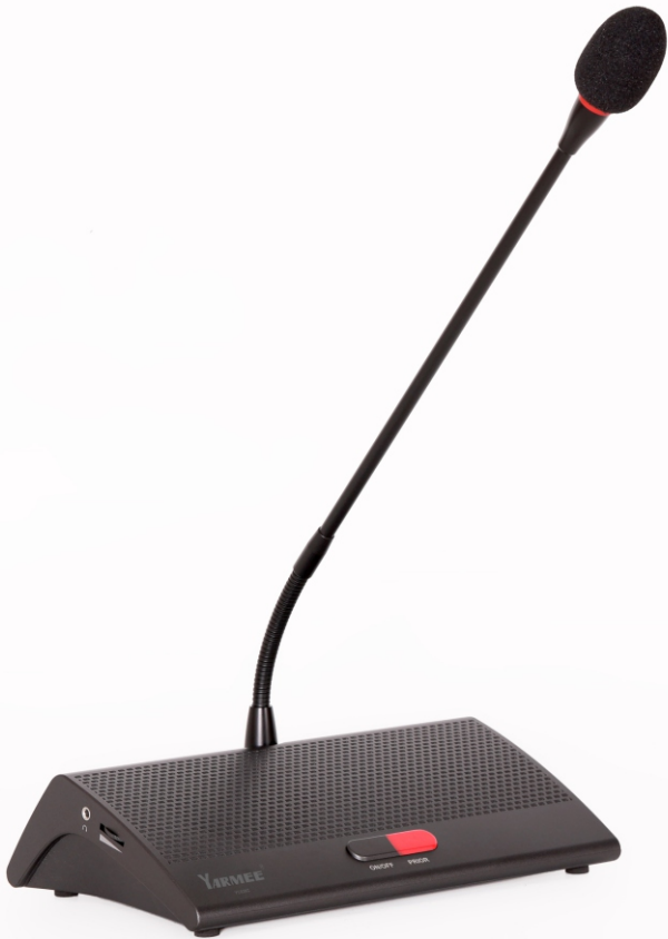
YC838C Chairman unit