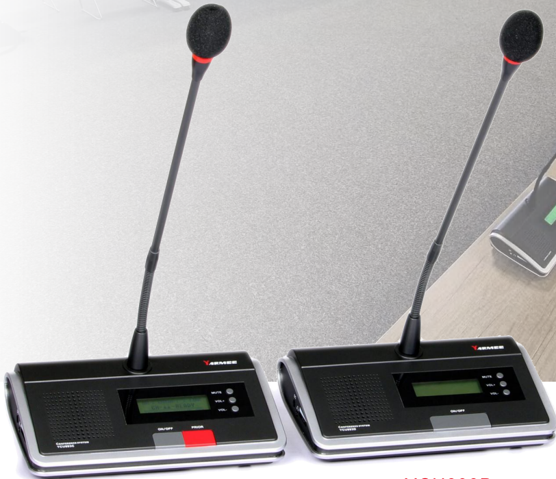
YCU893C chairman unit