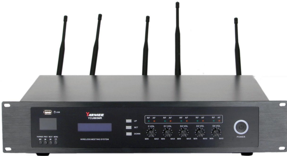
YCU893MR Central Control unit