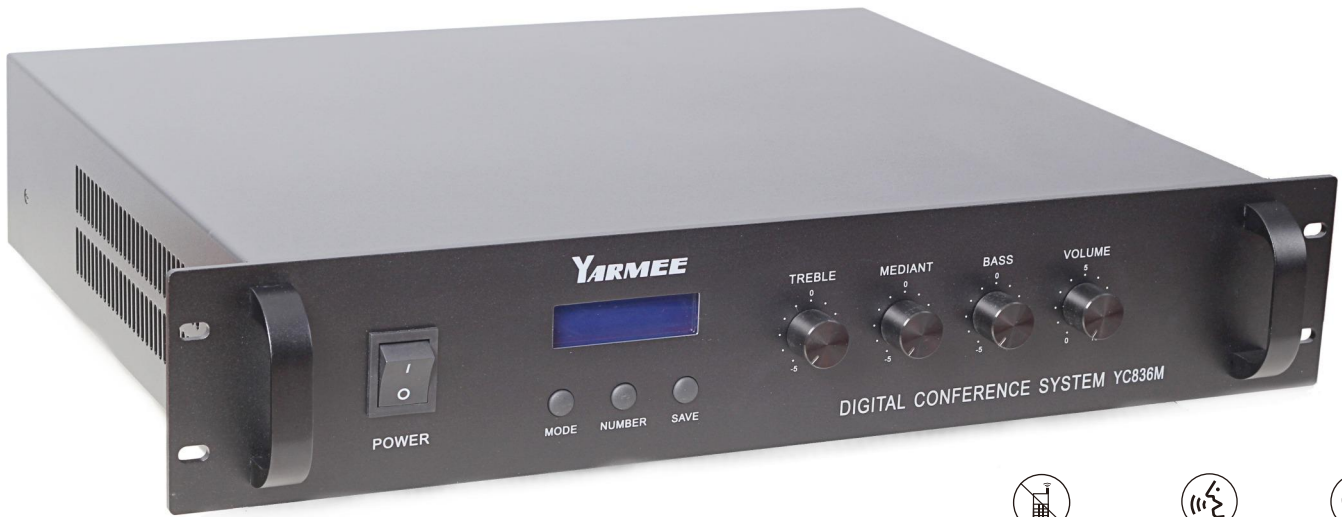
YC836M Central Control unit