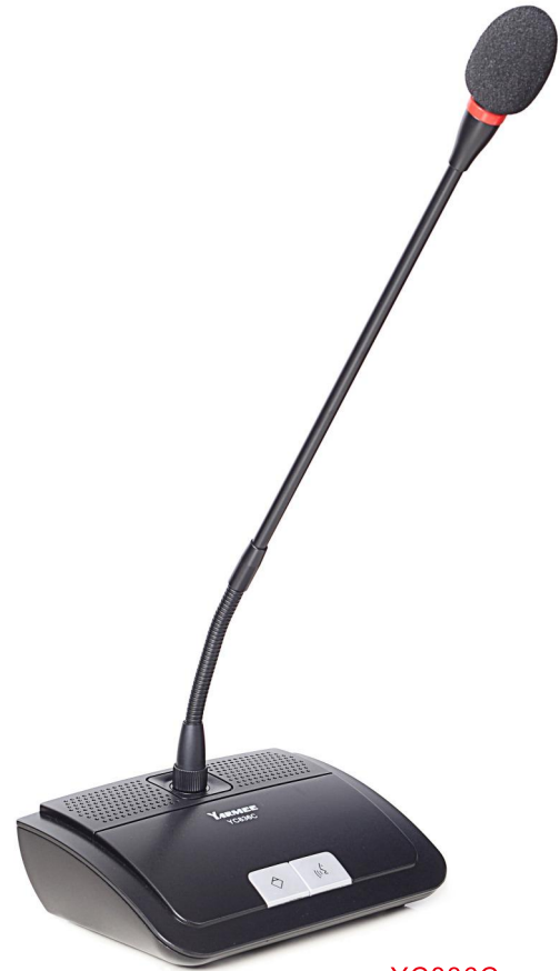
YC836C Chairman unit