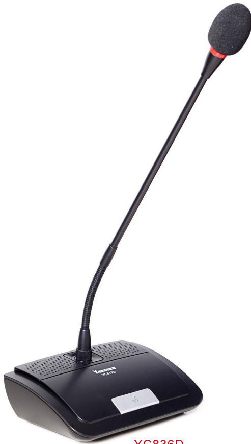
YC836D Delegate unit